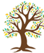
Falcon Home School