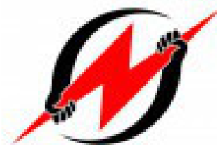
Power Technical Early College