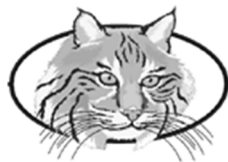
Springs Ranch Elementary