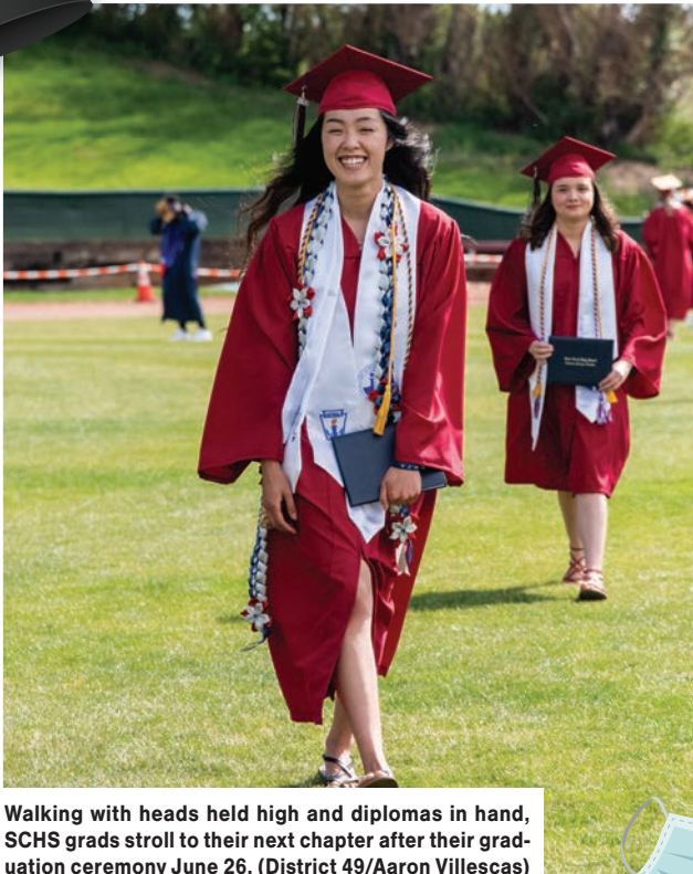
Walking with heads held high and diplomas in hand, SCHS grads stroll to their next chapter after their graduation ceremony June 26.