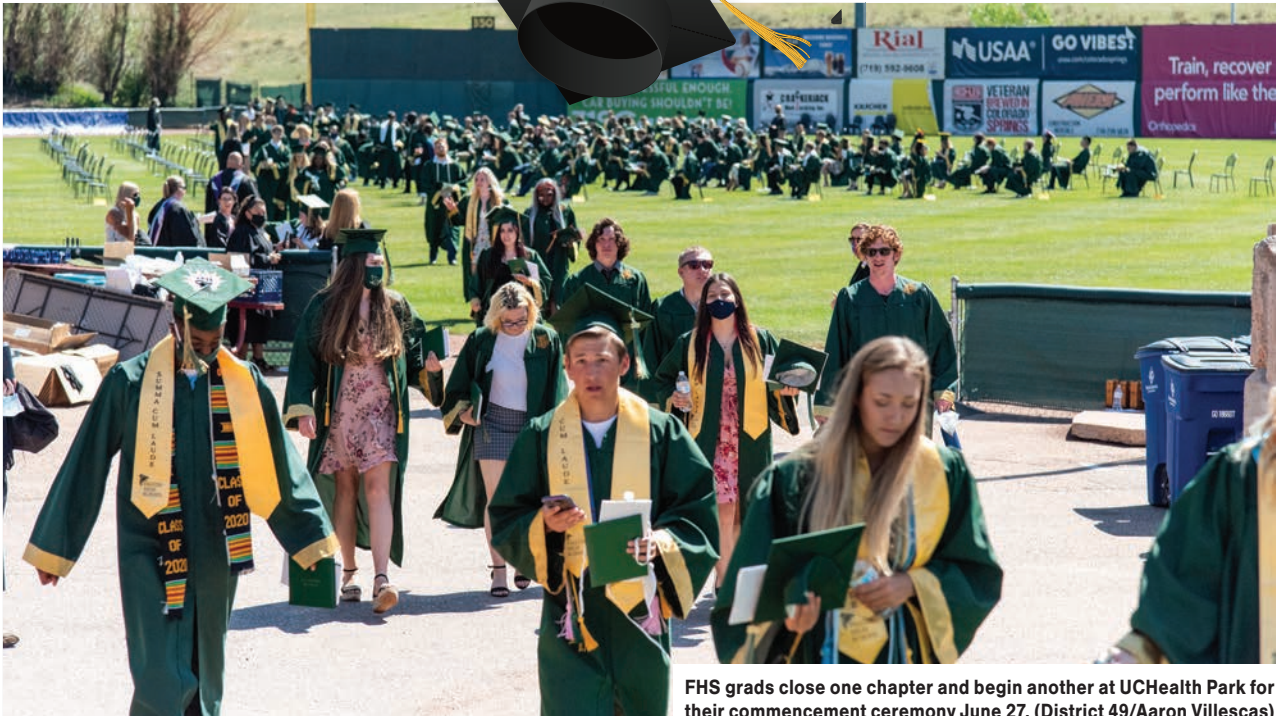
FHS grads close one chapter and begin another at UCHealth Park for their commencement ceremony June 27.