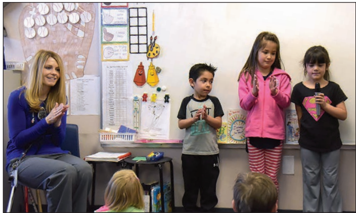
Kindergartners at Ridgeview Elementary School share “good things” to kick off each day as part of the school’s Capturing Kids’ Hearts program. The program promotes socio-emotional techniques to foster student engagement.