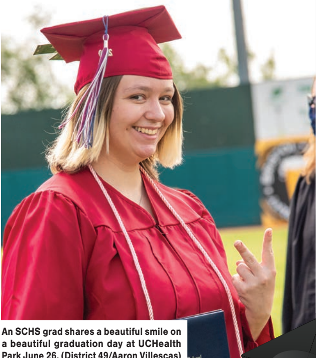
An SCHS grad shares a beautiful smile on a beautiful graduation day at UCHealth Park June 26.