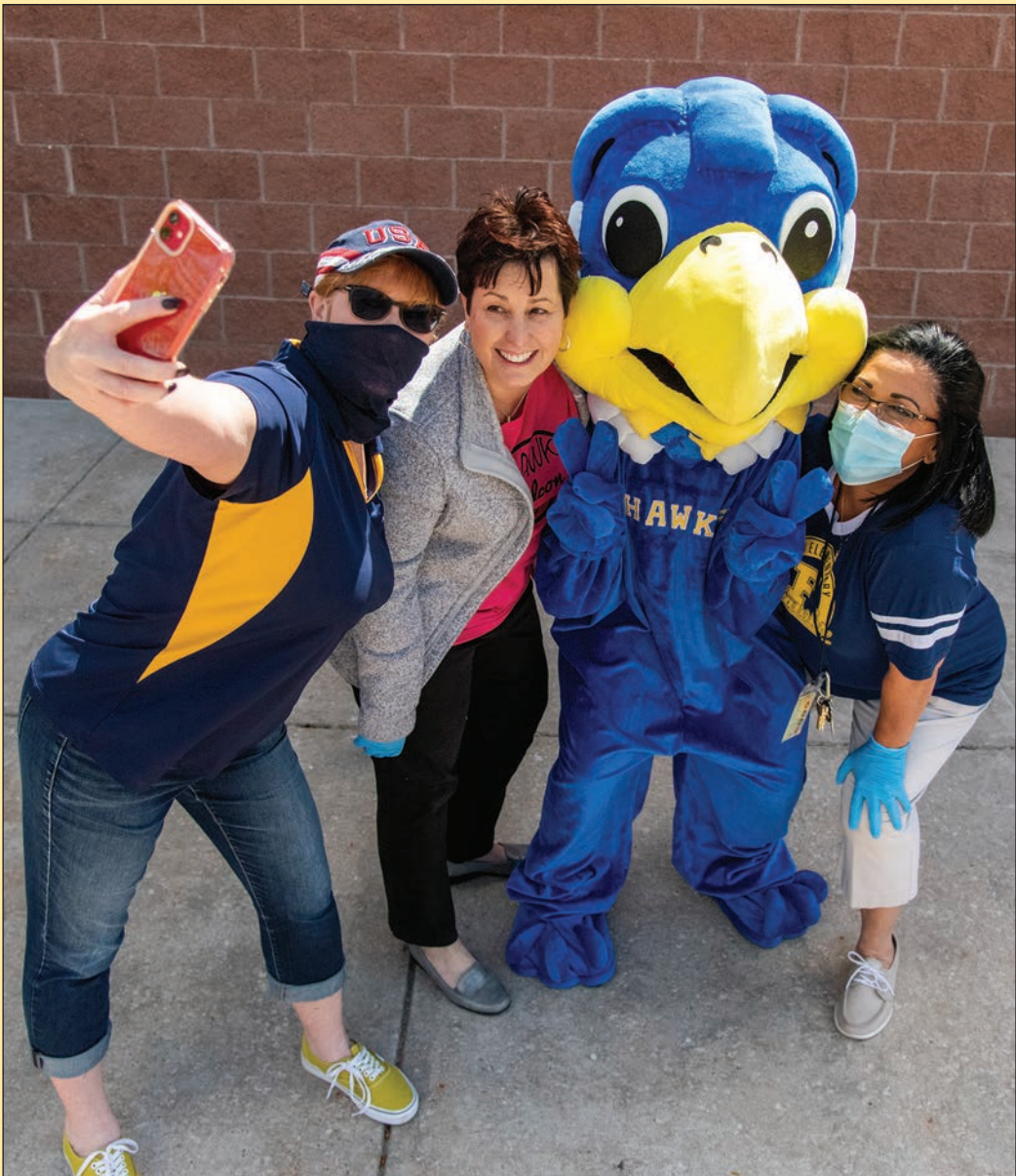
Falcon Elementary School of Technology staff pose with Falcon Zone mascots who helped with meal distribution May 14.