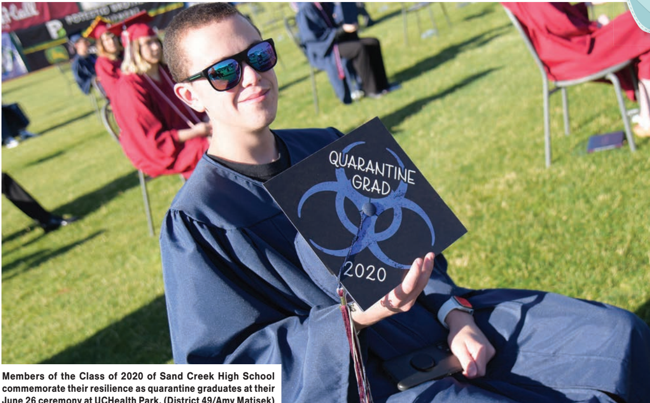
Members of the Class of 2020 of Sand Creek High School commemorate their resilience as quarantine graduates at their June 26 ceremony at UCHealth Park.