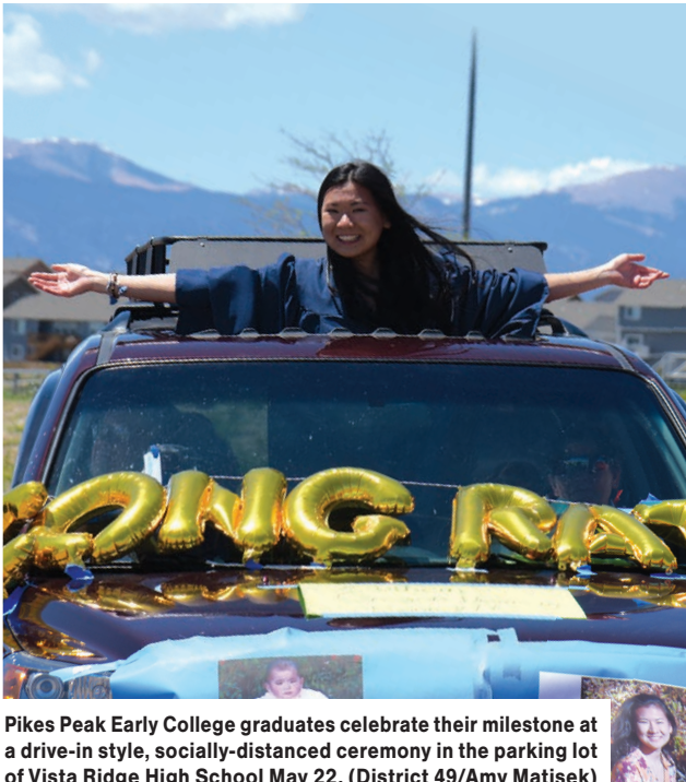
Pikes Peak Early College graduates celebrate their milestone at a drive-in style, socially-distanced ceremony in the parking lot of Vista Ridge High School May 22.