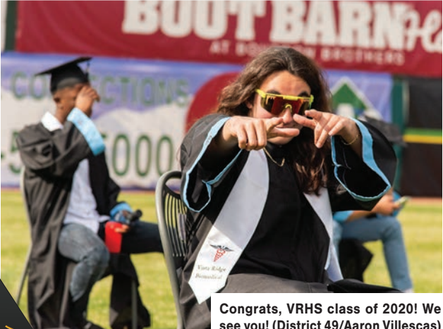
Congrats, VRHS class of 2020! We see you!