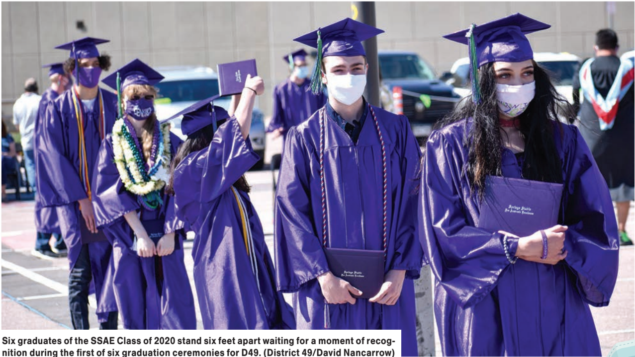
Six graduates of the SSAE Class of 2020 stand six feet apart waiting for a moment of recognition during the first of six graduation ceremonies for D49.