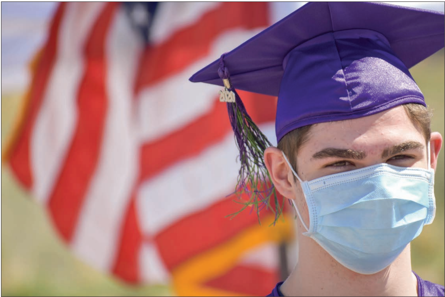
The Springs Studio for Academic Excellence Class of 2020 kicked off graduation season with a drive-in style ceremony May 22 at Vista Ridge High School. **See center spread for more Graduation 2020 photos**

By The D49 Communications Department Staff A Season of Uncertainty At the start of the 2019 - 2020 school year the class of 2020 anticipated the week leading into Memorial Day would be their time