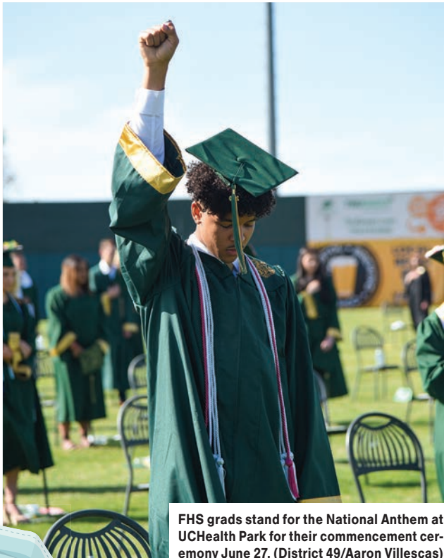
FHS grads stand for the National Anthem at UCHealth Park for their commencement ceremony June 27.