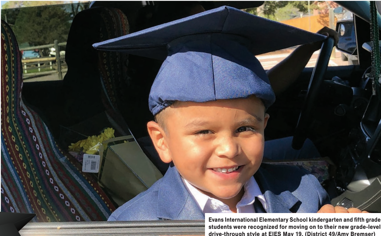
Evans International Elementary School kindergarten and fifth grade students were recognized for moving on to their new grade-level drive-through style at EIES May 19.