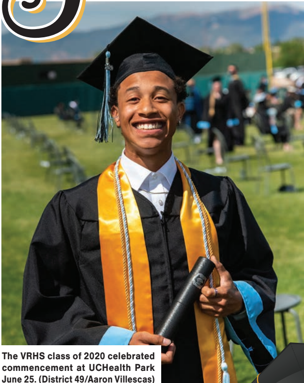
The VRHS class of 2020 celebrated commencement at UCHealth Park June 25.