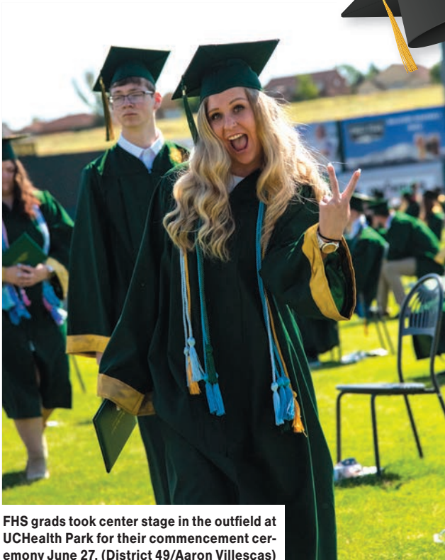
FHS grads took center stage in the outfield at UCHealth Park for their commencement ceremony June 27.