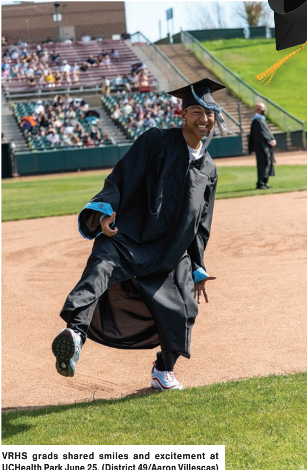
VRHS grads shared smiles and excitement at UCHealth Park June 25.