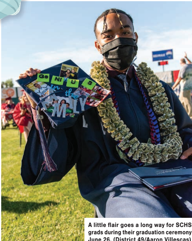
A little flair goes a long way for SCHS grads during their graduation ceremony June 26.