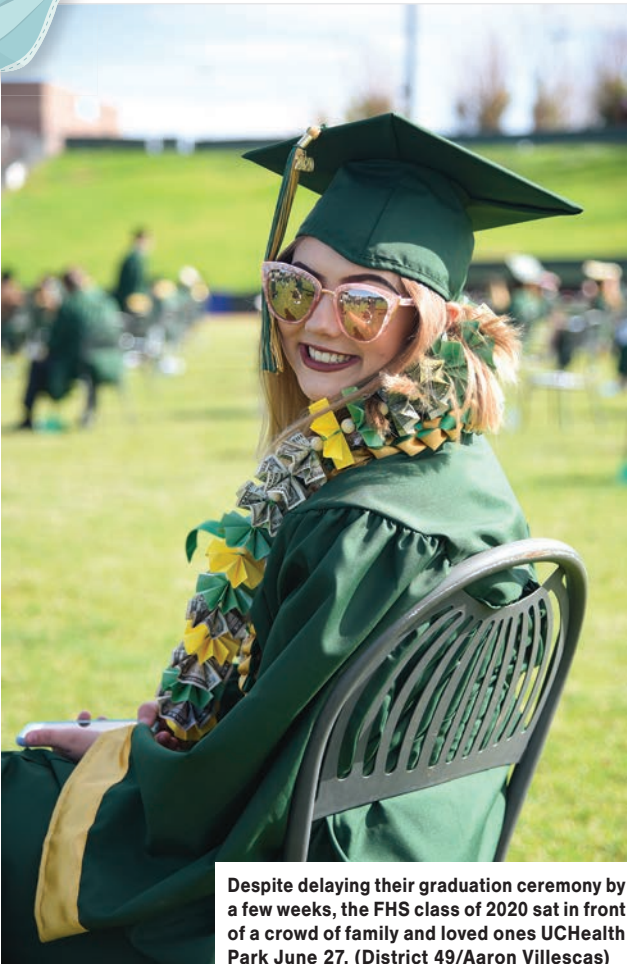
Despite delaying their graduation ceremony by a few weeks, the FHS class of 2020 sat in front of a crowd of family and loved ones UCHealth Park June 27.