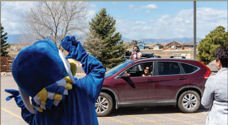
Falcon Zone mascots wave to families during the meal distribution May 14.

Recognize these faces? The Falcon Zone mascots teamed up to lend a hand with meal distribution at Falcon Elementary School of Technology Thursday, May 14. The district nutrition services team supported students and families by providing grab-and-go meals at three campuses throughout the season of E49. It was a big job, and a real treat to have a few extra hands to show some care for the D49 Family while spreading some school spirit!