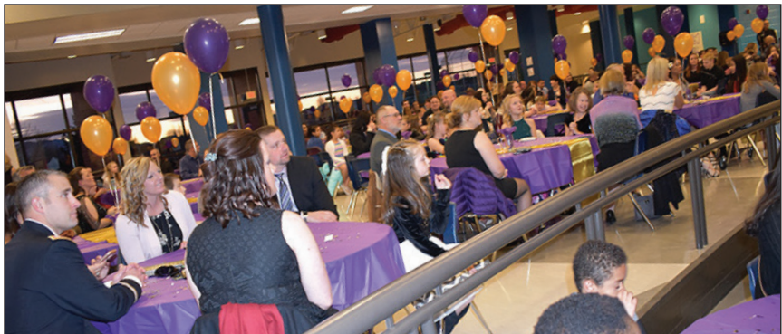
More than 400 attendees including elementary, middle and high school students with their parents in tow met at the S2S Purple Ball Jan. 26.