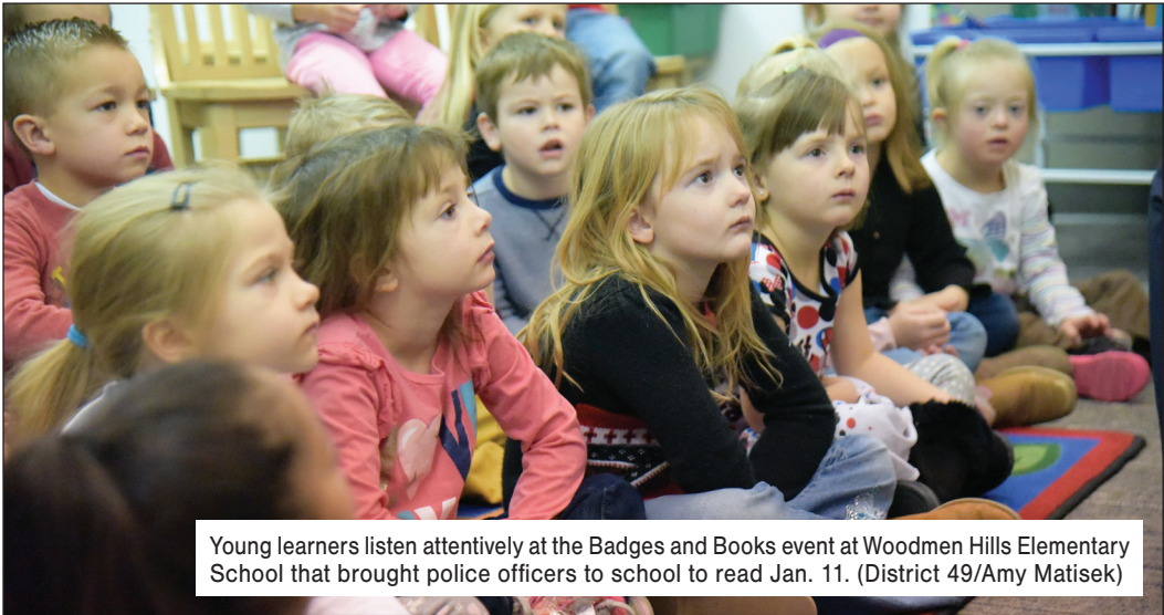
Young learners listen attentively at the Badges and Books event at Woodmen Hills Elementary School that brought police officers to school to read Jan. 11.