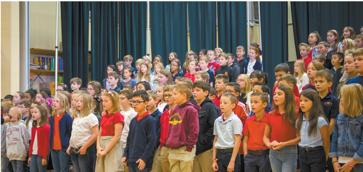
Banning Lewis Ranch Academy celebrated Veterans Day with an all-school assembly Nov. 10. Students were joined by family and friends in the gymnasium, many of whom are military veterans from the community.