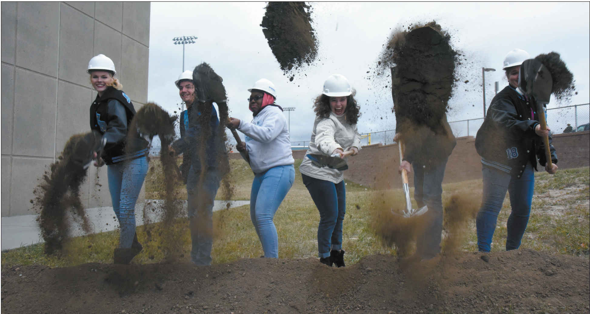
Students participate in groundbreaking festivities at Vista Ridge High School Oct. 26. The ceremony paved the way for new performing arts, classroom and gym facilities at the school.