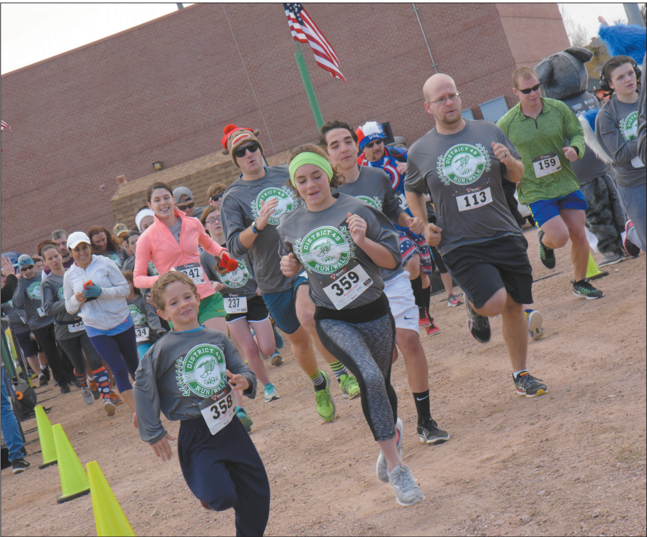
Runners and walkers leave the start line at the first-ever D4.9K Run/Walk Nov. 4 at Stetson Elementary School.