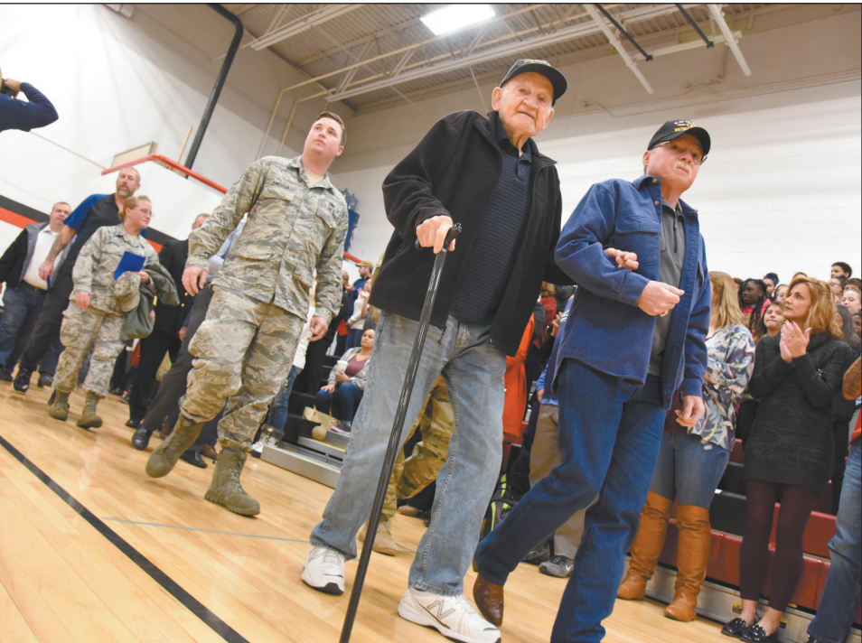
More than 50 current and former military service members were honored with a standing ovation during the Veterans Day celebration at Horizon Middle School Nov. 9.