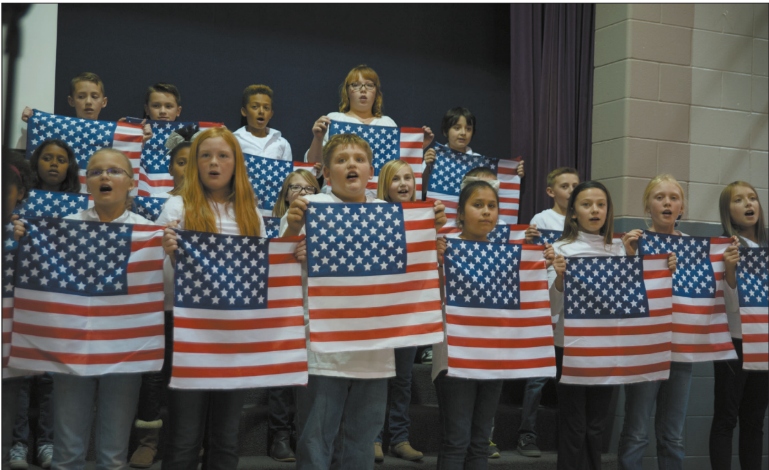
Fifth grade students hosted three patriotic performances of the musical, "A Celebration of Our Country," Nov. 9 at Ridgeview Elementary School.