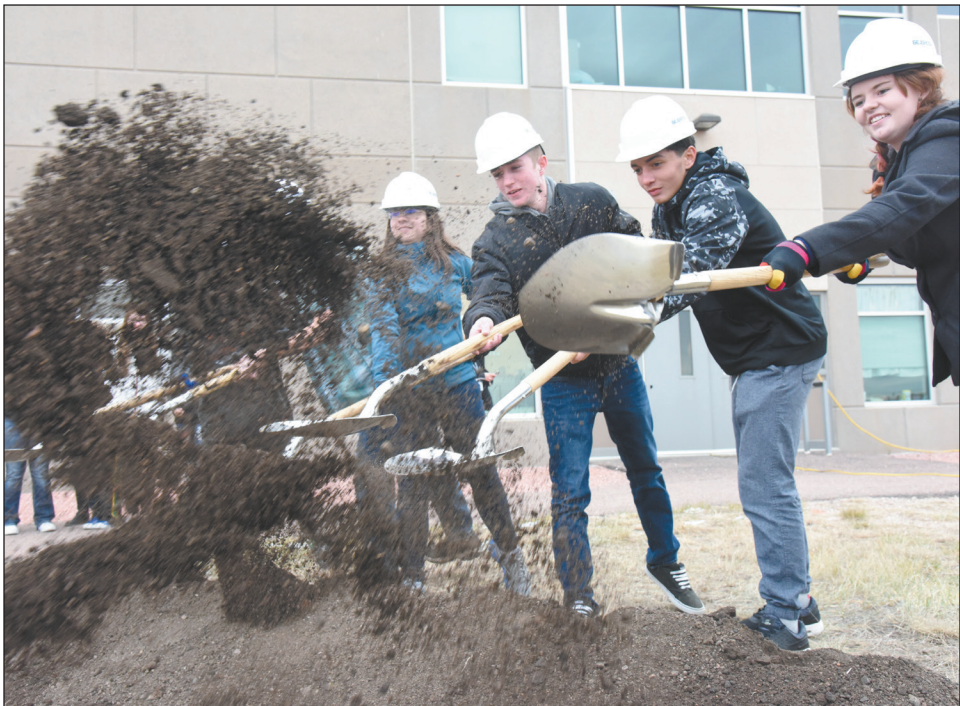
Falcon High School students break ground on a new academic wing at their school Oct. 27.