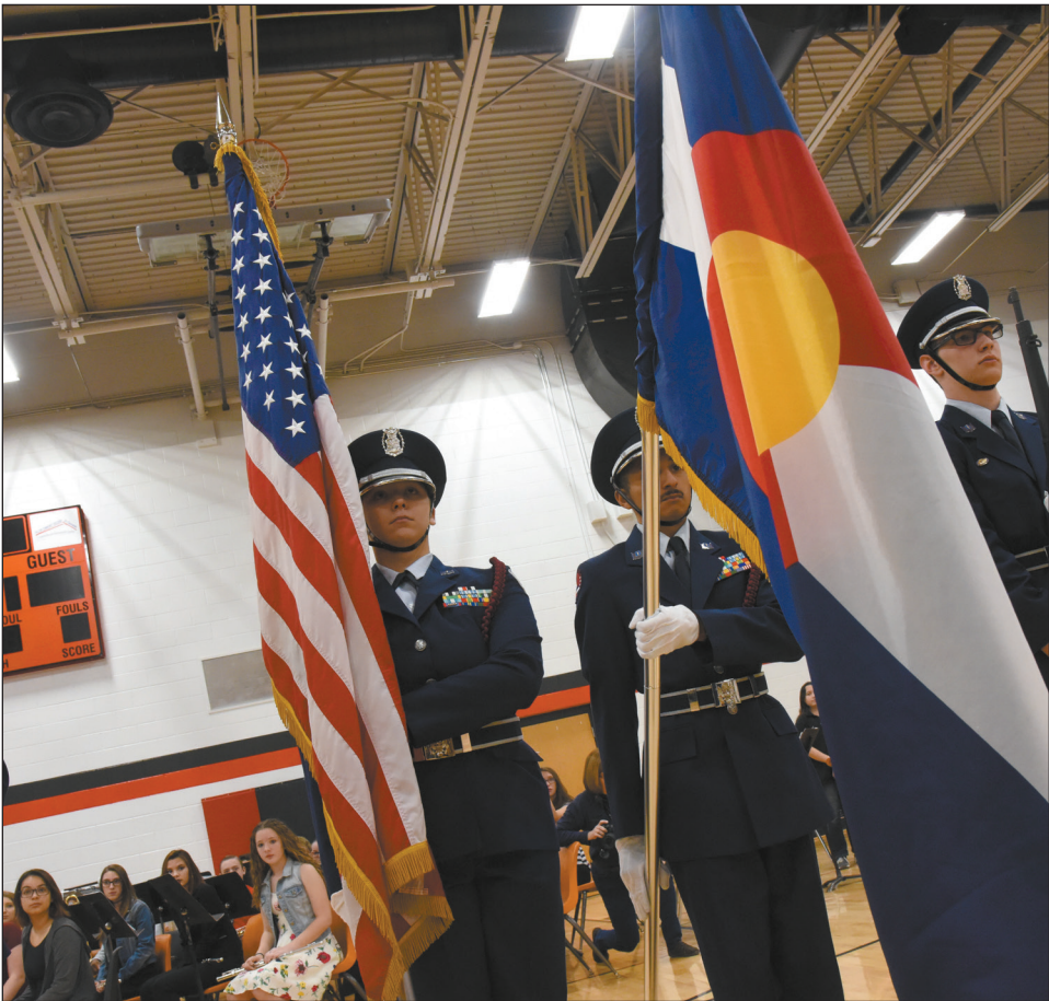
ROTC cadets from Sand Creek High School present the colors at Veterans Day festivities Nov. 9 at Horizon Middle School.