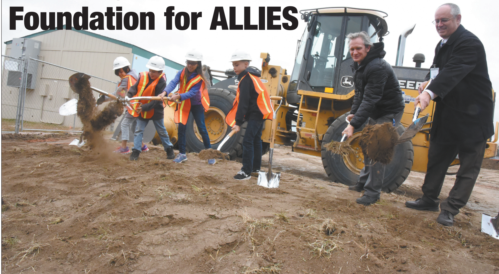
District 49 leaders and students break ground on the new ALLIES facility Oct. 26. The building is slated to open for the 2018-2019 school year and will provide resources for dyslexic students.