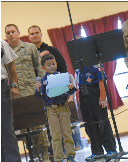
Boy Scouts prepare to start the Veterans Day celebration at Pikes Peak School of Expeditionary Learning with the Pledge of Allegiance Nov. 10.