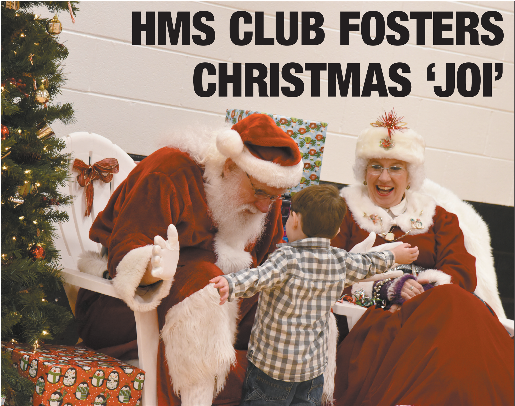
Santa and Mrs. Claus greet a young boy at the holiday party hosted for foster children by the Junior Optimist International Club at Horizon Middle School Dec. 9.