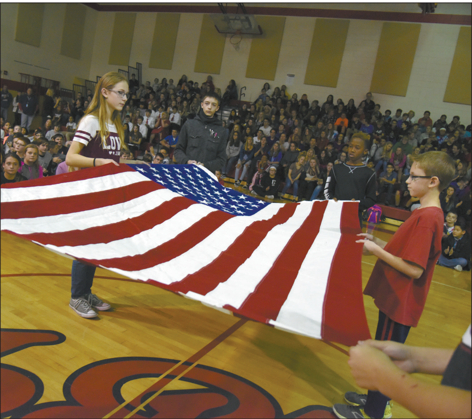
Students at Falcon Middle School present and honor the flag during Veterans Day activities Nov. 10.