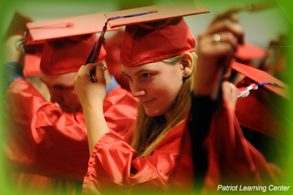
Patriot Learning Center

District 49 is pleased to provide its 2012-2013 Annual Report to the Public. Every year, school districts in Colorado report to their communities as required in the No Child Left Behind Act. Colorado law requires school districts to report accreditation data and details. District 49's strategic plan is built upon five key initiatives, our "big rocks" (p.11). Our plan focuses on ensuring every student achieves to his or her fullest potential. Our students achieved their highest scores in the past five years in many content areas, with educators attributing success to building positive relationships and integrating instruction across subjects.