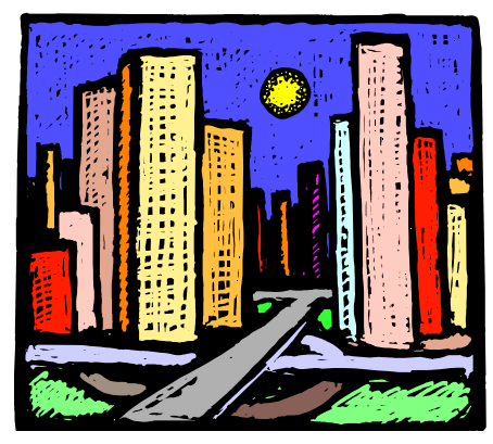
Resist Painting Nature at Night 11

Standard 1: Students recognize and use the visual arts as a form of communication.