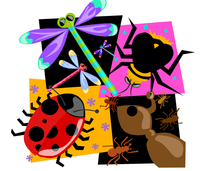
Shape and Pattern Fancy Flying Insects