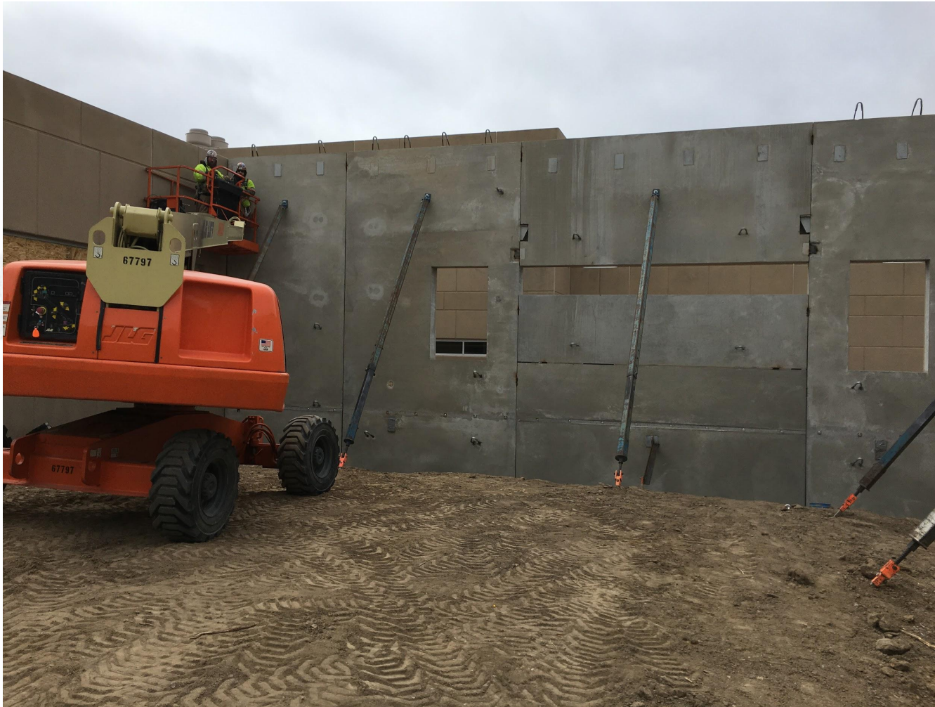
Additional Classroom Space