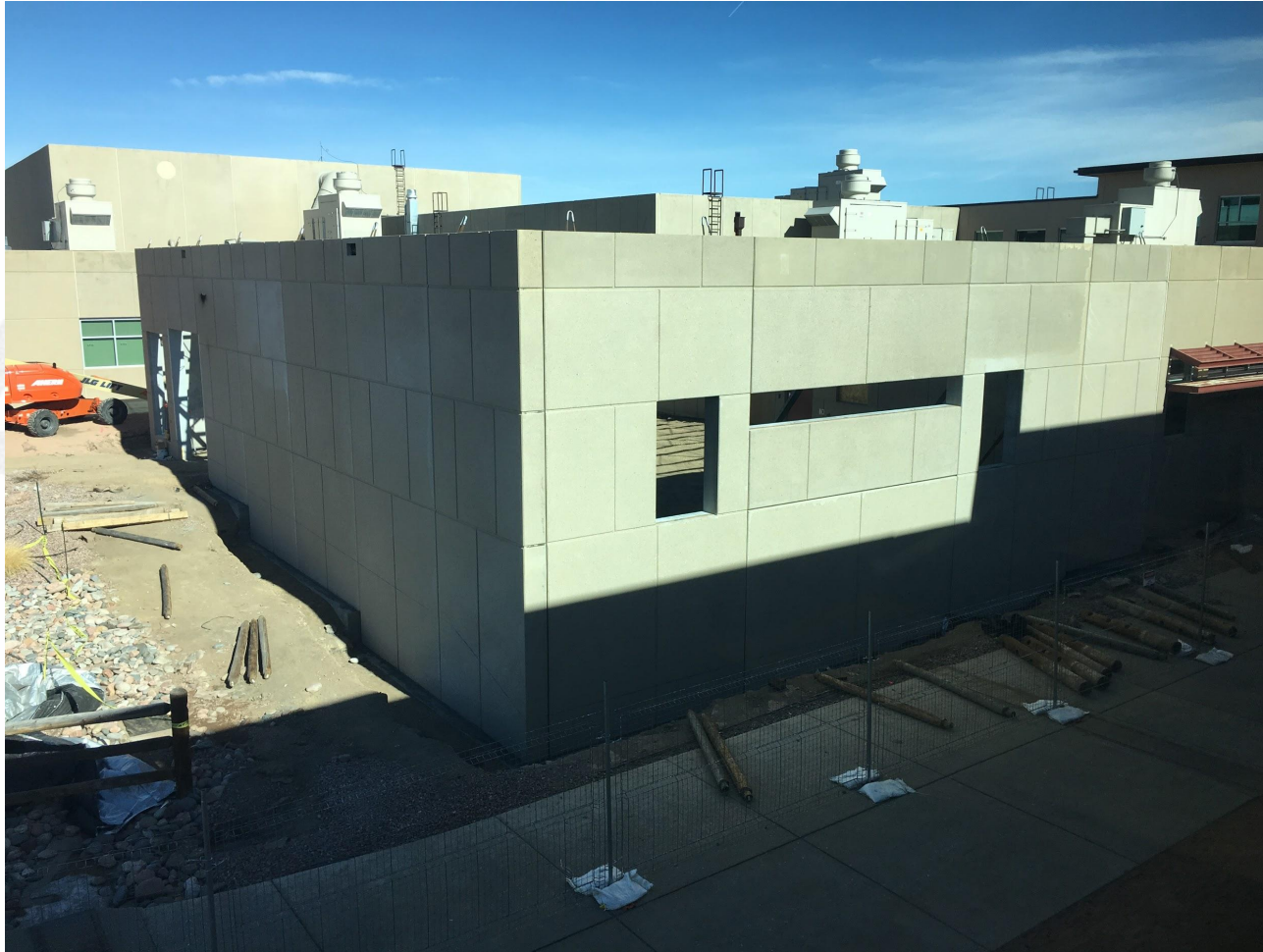
Additional Classroom Space