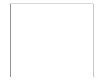
#ffffff CMYK: 0, 0, 0, 0 RGB: 255, 255, 255